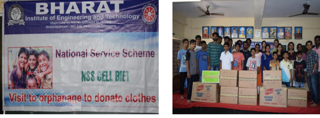
Fig. Visit to Orphanage BY NSS CELL, BIET