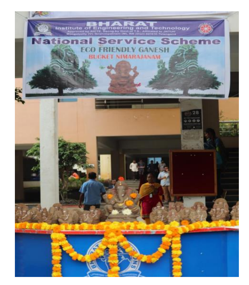
Fig.1. Start of rally