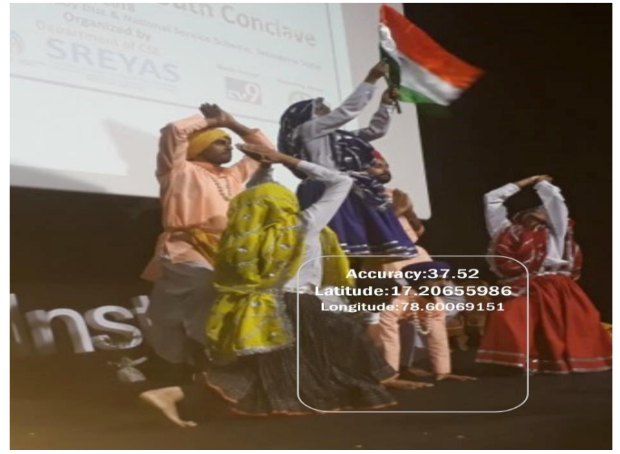
Fig.1 Dance Showing Haryana Culture

audience. The major theme of the event was to bring awareness among the youth about our national culture and familiarize them with our customs and traditions.