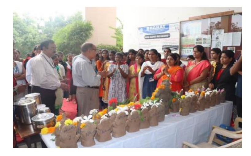
Fig3: Offering Prayers

Angalpally(V) Mangalpally(V) Ibhrahipatanam R. R. District E1 00 * 100