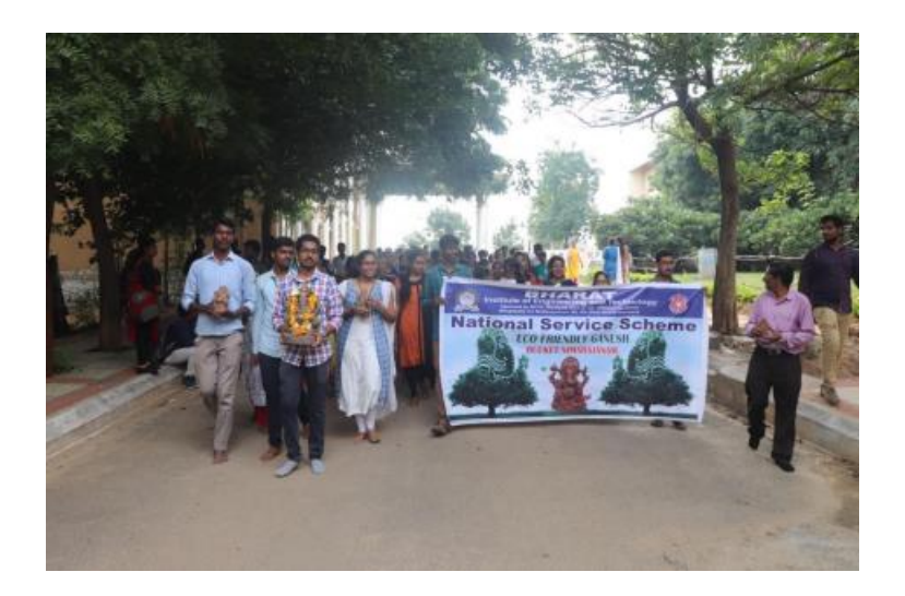
Fig.2. Immersion of Ganesh into water by students