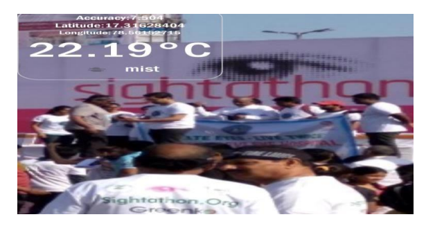
Fig.1 Start of rally

This program aims to create awareness in the people about eye donation. Eight students from Bharat Institute of Engineering have participated in the two kilometer rally blindfolded which started from People's Plaza towards Necklace Road. This event was conducted on 9/9/2018 at 7:30 AM. It is a joint initiative of Government of TELANGANA, SAKSHAM&NPCB.