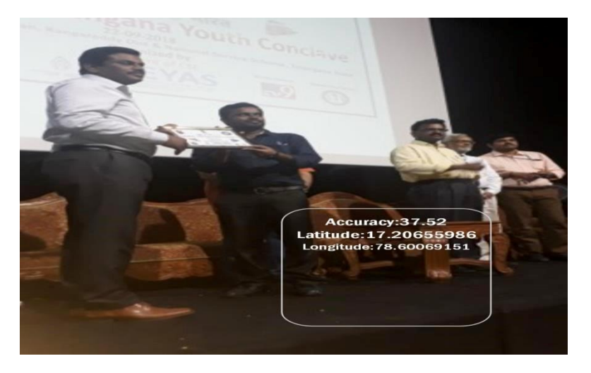
Fig.2 Memento Presentation