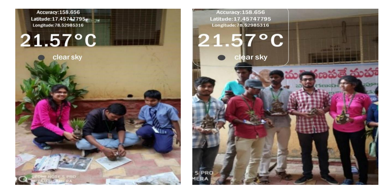
Fig.4 Group photo of NSS Volunteers

Fig.3 group photo of students with Ganesh idols